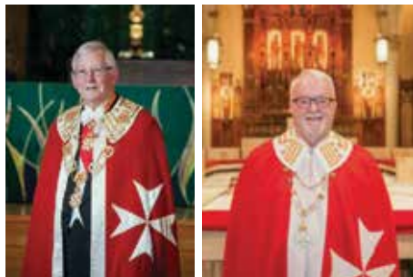
Grand Master Grand Commander

As many Members already know, the 2020 Sovereign Council meetings and events formerly announced will now not take place in Vancouver as planned