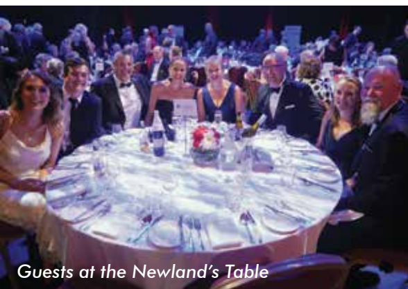
Guests at the Newland’s Table

Of course, the function would not have succeeded without the attendance of so many of our Members with their family and friends. A big thank you and congratulations to all involved. ✠