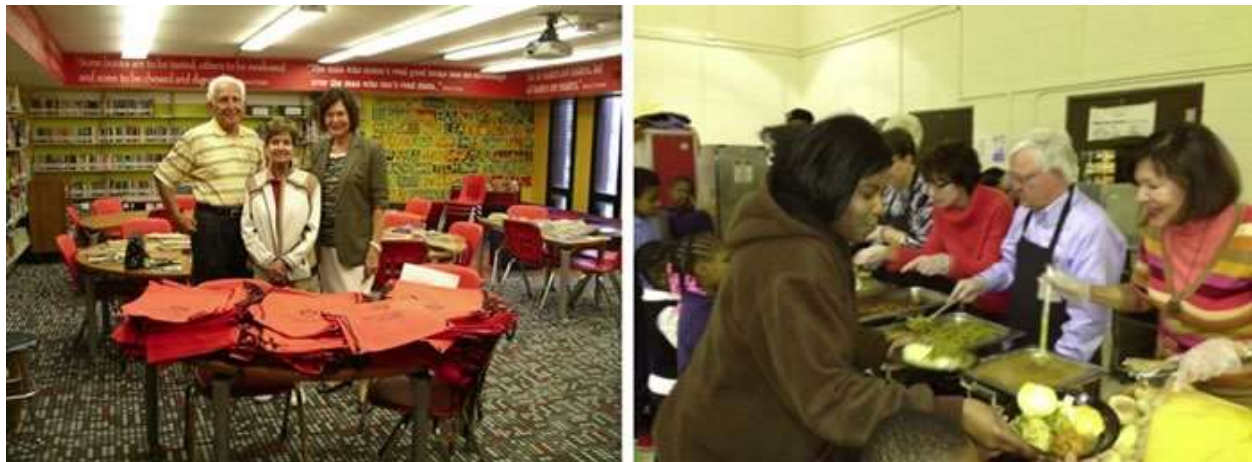
Marion Sterling Library Books and Christmas Dinner

For a full listing and description of the Cleveland Commandery’s many projects, please refer to the Cleveland Commandery Profile under “Who We Are – Commanderies.”