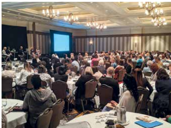
BC Care Providers Association Conference in 2019.

The Provincial Hospice Working Group (PHWG), represented by the BC Centre for Palliative Care, Victoria Hospice, Vancouver Island Federation of Hospices, Sovereign Order of St. John, and BC Hospice Palliative Care Association, envisions a collaborative network of organizations that will be instrumental in improving access to community-based whole person care to patients and their families in BC.